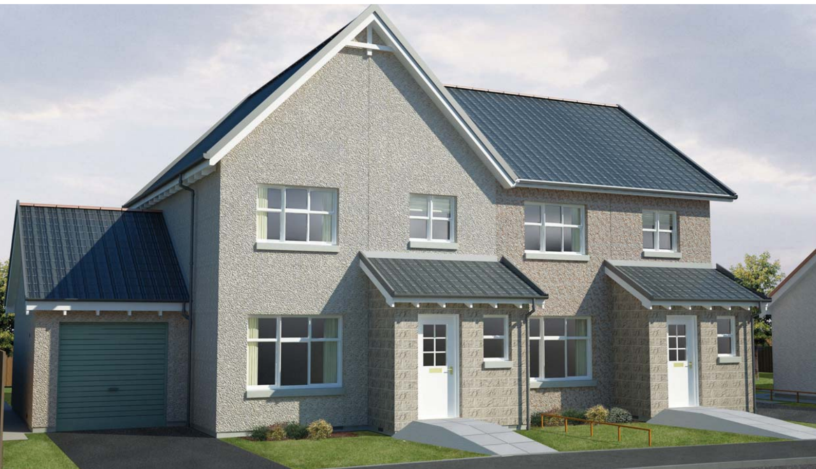
The Brucklay - Room sizes are approximate

Striking 3 bed semi-detached villa with lounge, open plan kitchen with dining area and double French doors leading to the rear garden. Spacious master suite, main bathroom and two further bedrooms.